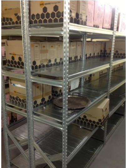
Well done to Kentish Council!

On the first day I collected some archival estrays in Devonport then headed down to meet with Aleasha Goss at Kentish Council. I was impressed to see the new purpose built records storage facility which has been built at the back of the Council building, complete with a heat pump to keep the records at a constant temperature. The facility was secure and clean with good metal shelving.